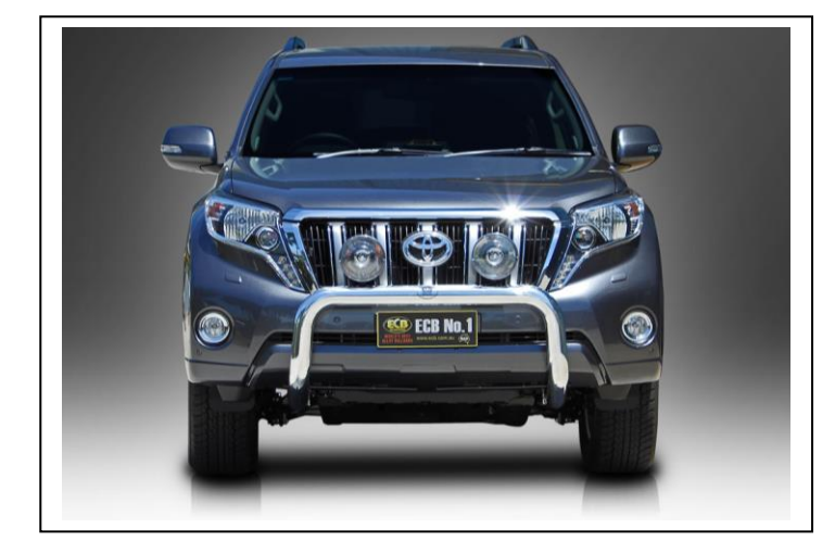
Figure 5: Front view, 76mm Nudge Bar