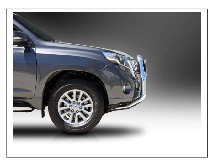
Figure 6: Side view, Series 2 Nudge Bar.