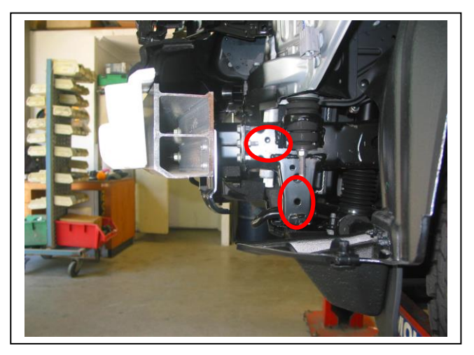
Figure 1: Passengers side of vehicle showing holes used in fitment