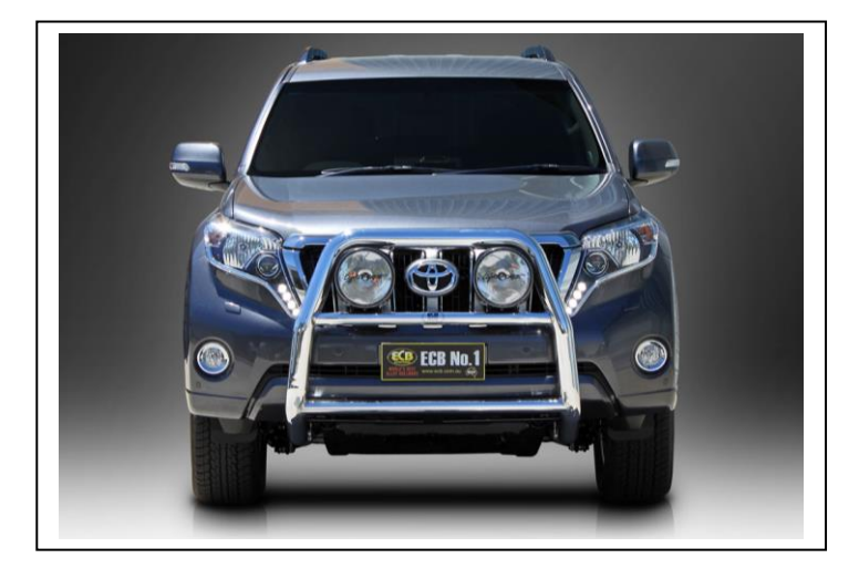
Figure 7: Front View, Series 2 Nudge Bar