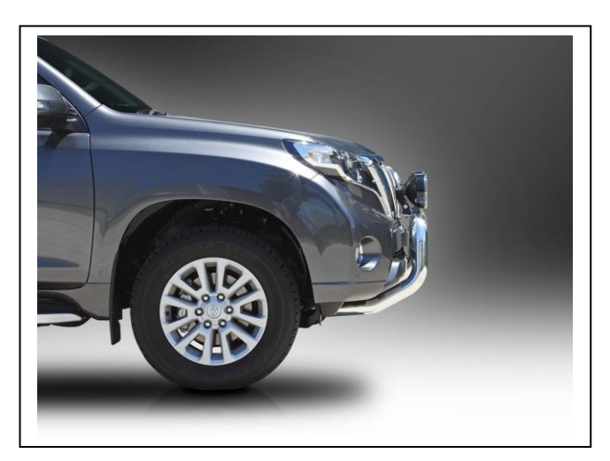
Figure 4: Side view 76mm Nudge Bar.