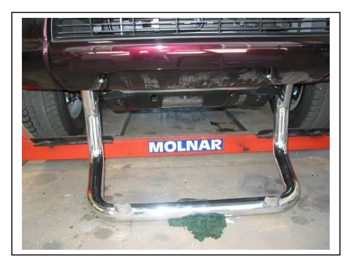
Figure 3: Protection bar positioned ready for fitment.